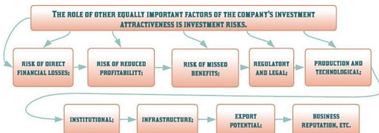
Figure 1: Other equally important factors of the company's investment attractiveness

The main goal of the investor is to choose the most reasonable investment object. Such an object should have the most favorable development prospects, as well as high efficiency of investments. Choosing an investment object may not happen by itself, because it is preceded by a very complicated process of careful selection, evaluation and analysis of various alternatives. The investment attractiveness of the enterprise is a comprehensive assessment of the parties in terms of its activities and prospects. The main goal of analyzing and evaluating the investment attractiveness of the company is to determine the feasibility of investing in a particular object.