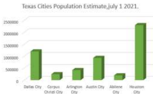
Figure 1: Texas estimate population chart of year 2021 [2].