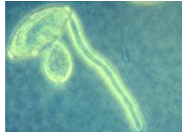
Figure 2. Germinating sporangia