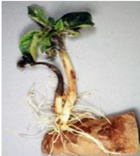
Figure 4. Potato seedling