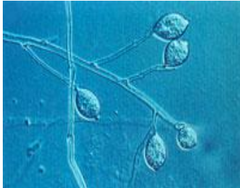
Figure 1. Compound sporangiophore

on their own (Figure 2). Zoospores are biflagellate (have two flagella) (Figure 3), with one tinsel and one whiplash flagellum pointed anteriorly and posteriorly, respectively. Zoospores encyst and infect the plant after swimming on the surface of the host plant.