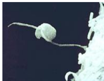
Figure 3. Zoospore with biflagellate flagellum and sporangia (Jean Ristaino, Gail L. Schumann, Cleora J. D'Arcy)

According to Nowicki, Foolad, Nowakowska, & Kozik, (2012) Phytophthora infestans persists between potato crops as mycelium in infected tubers or tomato fruit in the absence of the oospore stage. Sporangia may be developed on diseased tubers or new volunteer sprouts that appear the following spring if they are left behind at harvest or thrown at the boundaries of fields. Sporangia sporangia sporangia sporangia sporangia sporangia Seed potatoes can become infected, resulting in stem lesions that can kill the plant (Figure 4); freshly cut seed tuber surfaces are particularly vulnerable to infections from airborne spores in contaminated storage facilities. Local infection can arise if infected seed is planted. The virus spreads by moving through infected tuber tissues, and clonal lineage asexual reproduction is common (see Disease Cycle) (Figure 5).