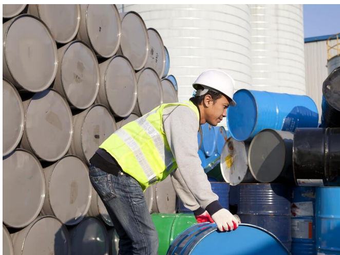
Fig. 3 Flammable Liquid.

Flammable Liquid and Gases: These fires, which often occur at chemical plants, can be disastrous.