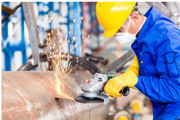
Fig. 2 Hot work.

Hot work disasters can be prevented by following proper safety procedures such as: