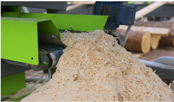
Fig. 1 combustible dust

Combustible Dust: Often overlooked, and highly deadly, combustible dust is a major cause of fire in food manufacturing, woodworking, chemical manufacturing, metalworking, pharmaceuticals industry. The reason is that just about everything, including food, dyes, chemicals, and metals even materials that are not fire risks in larger pieces has the potential to be combustible in dust form. However, this small explosion isn't the problem. The problem is what happens next. If there's dust in the area, the primary explosion will cause that dust to become airborne. Then, the dust cloud itself can ignite, causing a secondary explosion that can be many times the size and severity of the primary explosion. If enough dust has accumulated, these secondary explosions have the potential to bring down entire facilities, causing immense damage and fatalities.