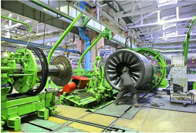
Fig. 4 Equipment and Machinery

Equipment and Machinery: Faulty equipment and machinery are also major causes of industrial fires (Hassan, 1999). Heating and hot work equipment is typically the biggest problems here in particular, furnaces that are not properly installed, operated, and maintained. In addition, any mechanical equipment can become a fire hazard because of friction between the moving parts. This risk can be brought down to practically zero simply by following recommended cleaning and maintenance procedures, including lubrication.